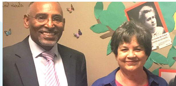
U.S. Congresswoman Lois Frankel visits Roncincito del Sol and said the facility is taking good care of girls in its custody.

“USCRI [has] opened a model government-funded shelter in southern Florida” —ASSOCIATED PRESS