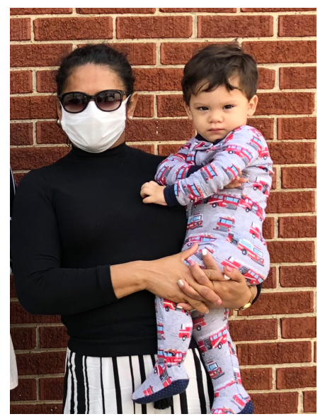
New neighbors from Honduras resettled by our Detroit, MI office.