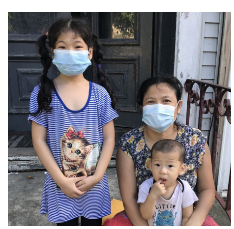
A refugee family resettled by USCRI in the Albany, NY area.