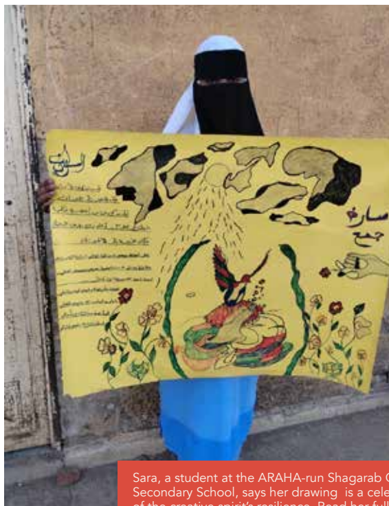
Sara, a student at the ARAHA-run Shagarab Girls Secondary School, says her drawing is a celebration of the creative spirit's resilience. Read her full poem and view her artwork on the next page

Today, over 17 million children in Sudan require lifesaving humanitarian aid. Two out of every five people in Sudan are facing crisis levels of acute food insecurity—nearly 19.5 million people—and the risks are rising for children. An estimated 825,000 children under five years old are expected to suffer from severe acute malnutrition ( SAM ) in 2026, the deadliest form of malnutrition for children.